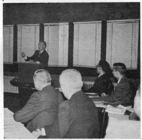
SATURDAY NIGHT CLUB

upon arrival, I have heard one of these make the statement that he loses that tired and weary feeling as soon as this profitable meeting begins. The reader may gather from this article that we of the Sunday night Spokesman's club take great delight and satisfaction in being privileged to attend. The truth of the matter is that we tend. The truth of the matter is that we consider time well spent and that there is nothing remotely comparable to the multitudinous benefits and rich rewards one receives from continual, whole-hearted participation.